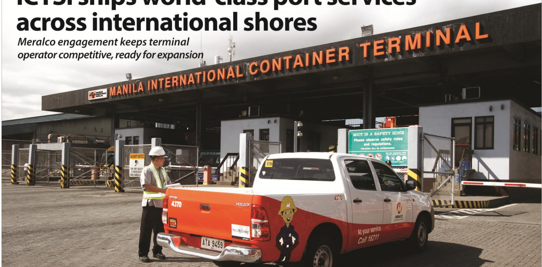
The Manila International Container Terminal (MICT) is ICTSI's flagship port. Part of the Port of Manila, the MICT is a critical hub for the country's trade and commerce, a source for employment for many Filipinos, and is rated the 36th busiest port in the world out of 100 by Lloyd's List Intelligence .

Meralco engagement keeps terminal operator competitive, ready for expansion